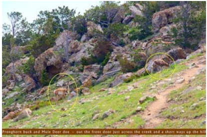
Franshore Back and Main Deer Doe - put the front door just across the creek and a short walk up the hill